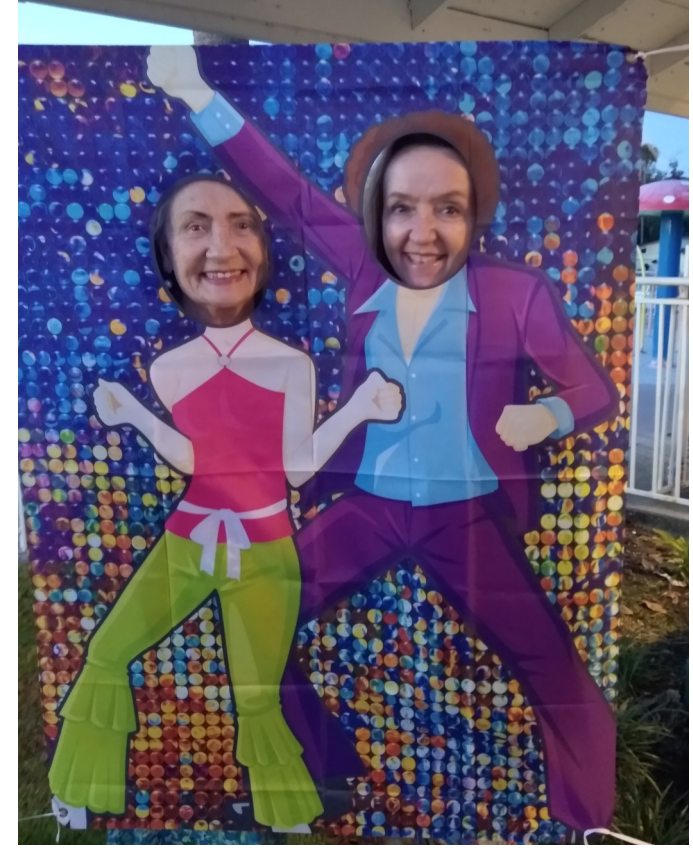
DID YOU DISCO?